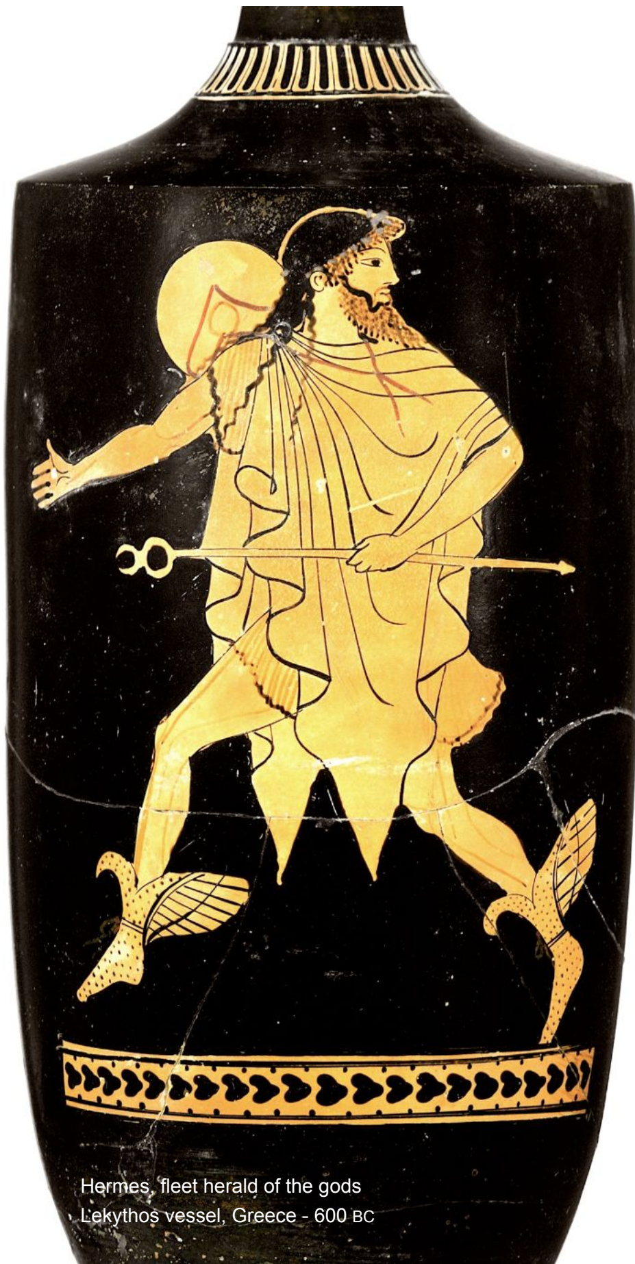
Hermes, fleet herald of the gods Lekythos vessel, Greece - 600 BC

Comparable iconography is also seen among many preceding cultures of the Middle East. In ancient Egypt, the deity Thoth was depicted as an ibis-headed humanoid or a baboon, and was honored as the god of the moon, wisdom, glyph writing, sciences, magic, high arts and judgment. Thoth was also called by the votive name 'Djehuti', which is composed of 4 Paleo-Sanskrit hieroglyphs, reading: d j e h u t i , meaning "endless, invincible, receptive rays" referencing the Akashic field of infrasound standing wave resonance.