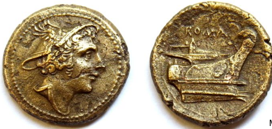
Mercurius semuncia Roman coin - 200 BC

Sarama became Hermes in Greek mythology; and the Panis became Pan. Greeks borrowed many Hindu stories and altered them beyond recognition. Hermes is the son of Zeus and Maiya. From the day of birth Hermes was cunning and stole the cows of Apollo. He became the herald of the gods and escort of the shades of the dead... 3