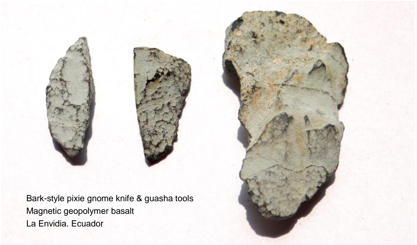
Bark-style pixie gnome knife & guasha tools Magnetic geopolymer basalt La Envidia. Ecuador