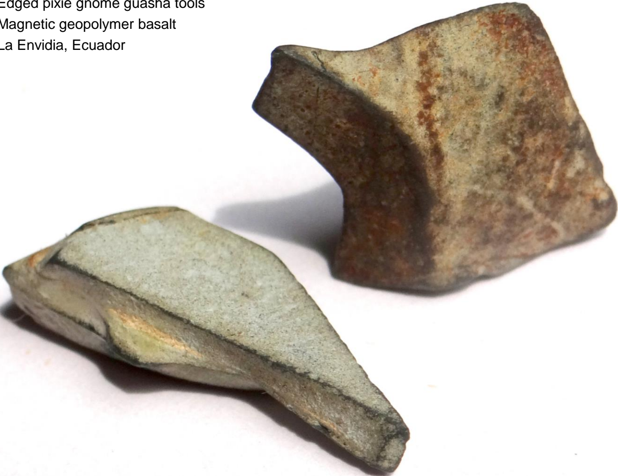
Edged pixie gnome guasha tools Magnetic geopolymer basalt La Envidia, Ecuador