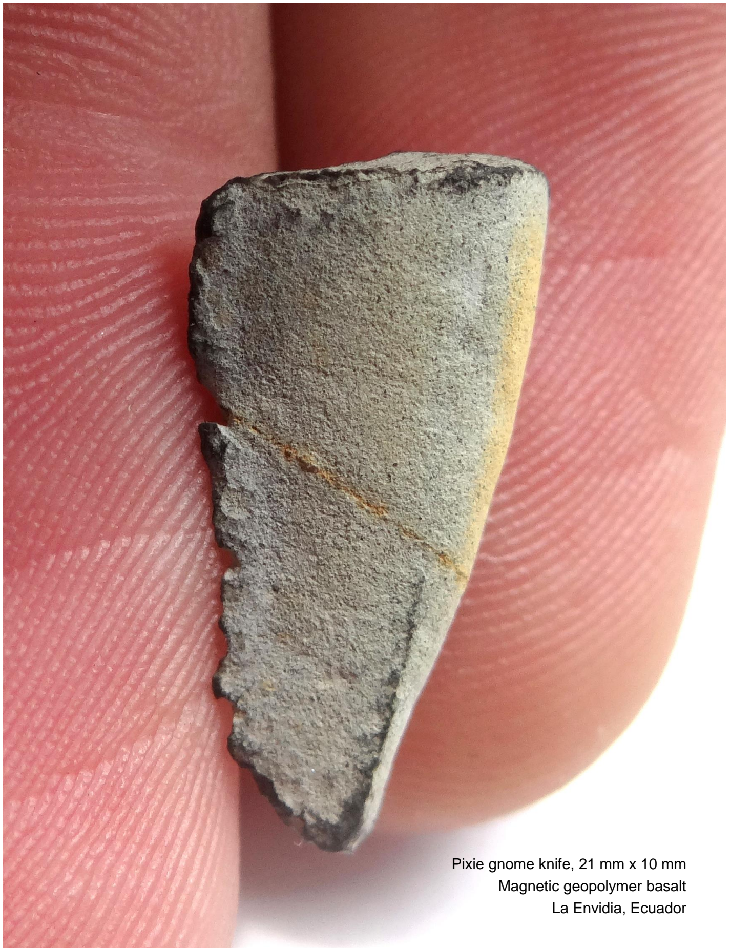
Pixie gnome knife, 21 mm x 10 mm Magnetic geopolymer basalt La Envidia, Ecuador