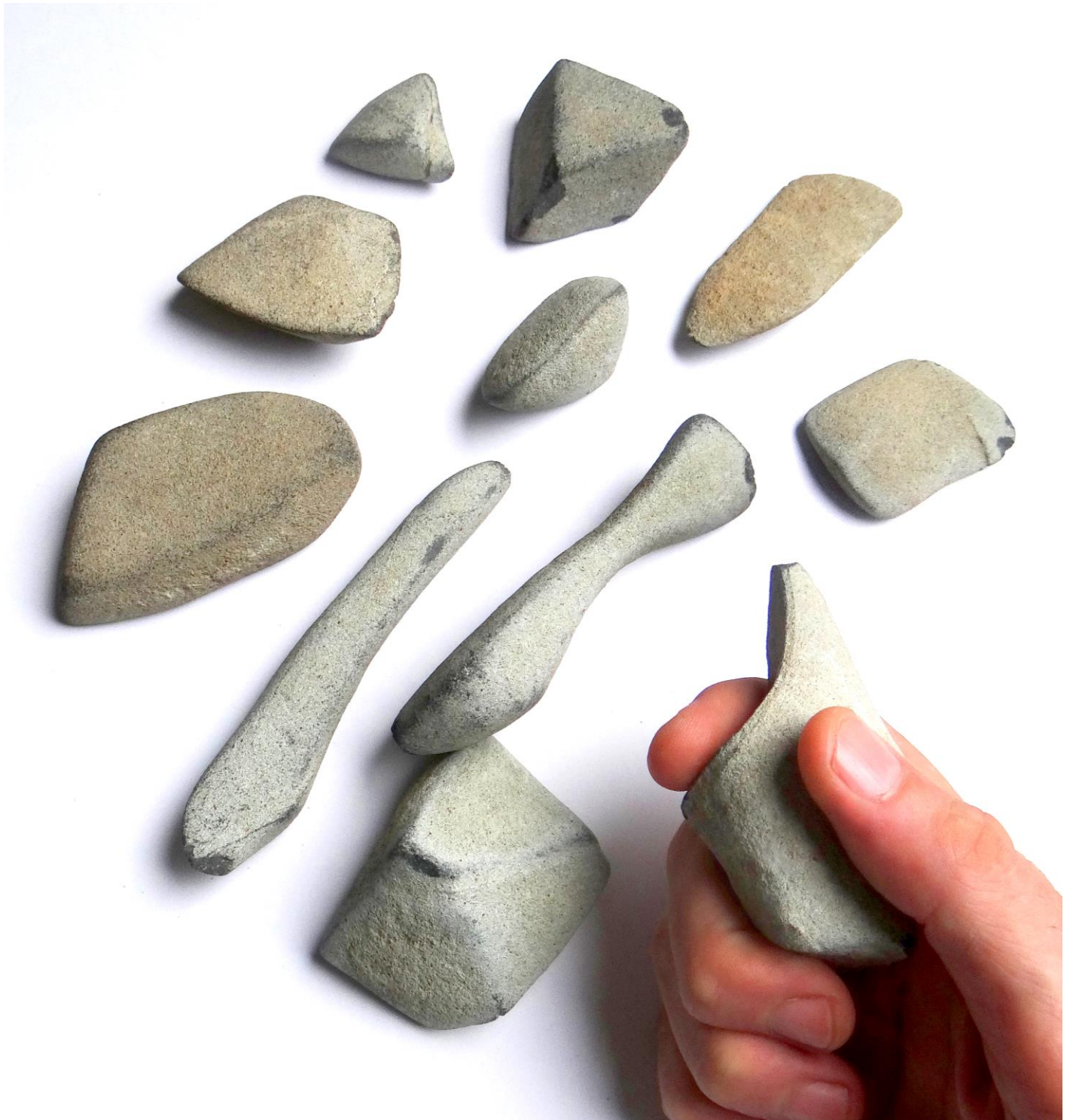
Pixels & Lucky Charms